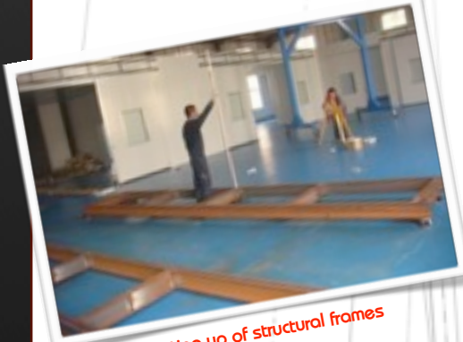
Setting up of structural frames