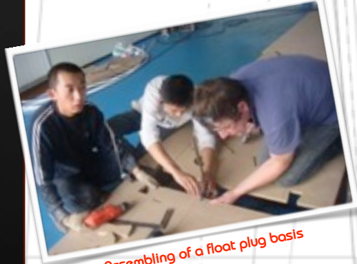
Assembling of a float plug basis